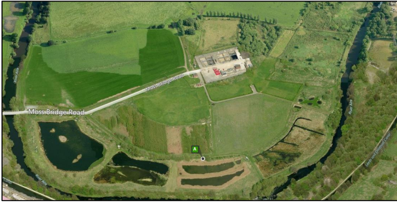
Esholt Hall Scargill Reservoir Track