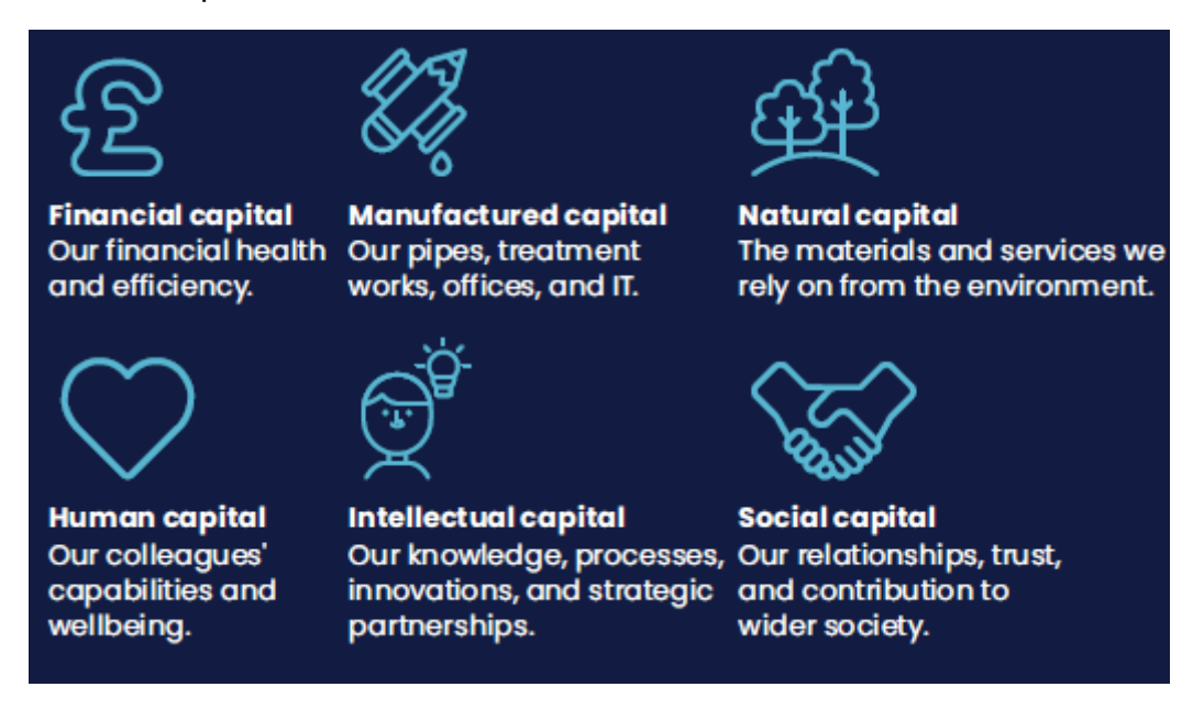
Figure 1: The Six Capitals – these are the resources we rely on and that we impact, both positively and negatively, through our business activities.

capitals approach can provide a much more detailed understanding of a company's performance than is captured in standard financial or operational performance reports.