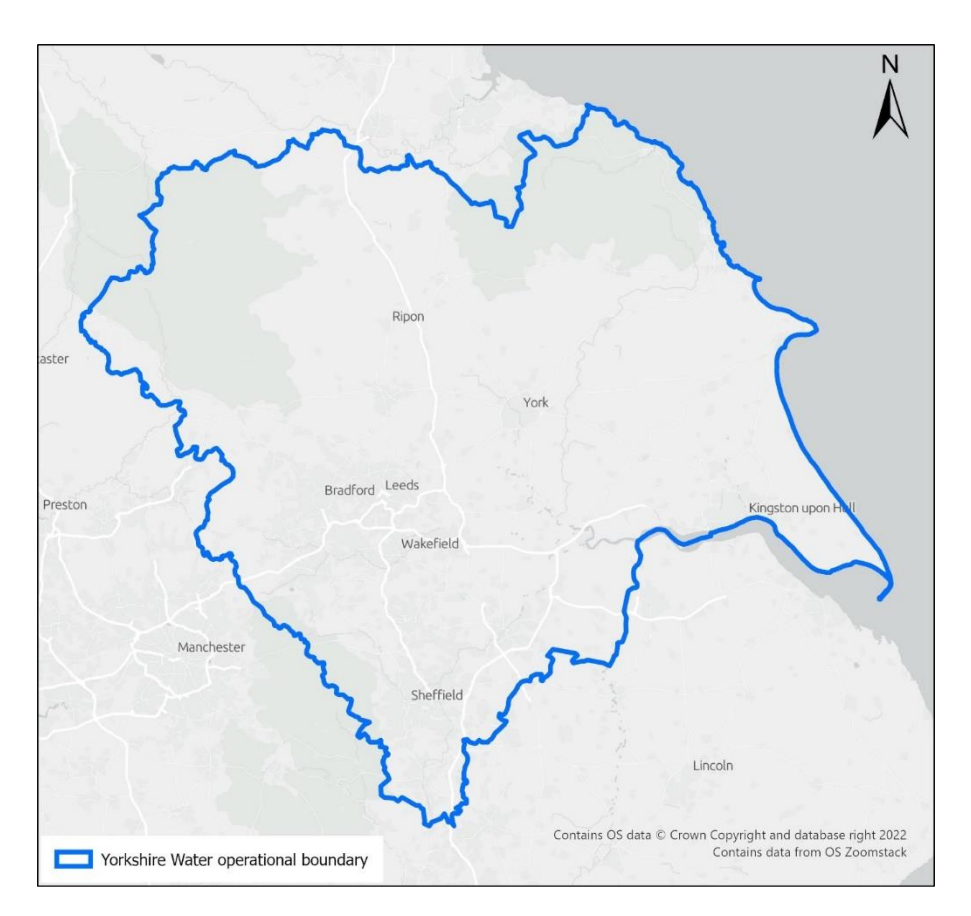
Figure A1: Yorkshire Water's operational boundary

• Spend is measured at the point in time when a payment is cleared, to align with when the benefit is received by the supplier.