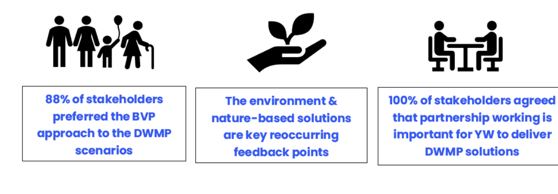
Figure 2 - Preferred Scenario Feedback