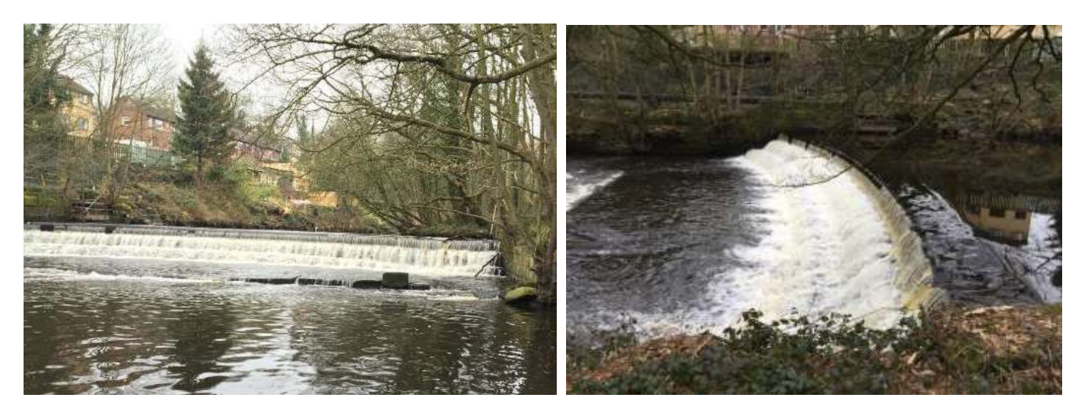
Figure 2: Wharncliffe Weir

We are currently working in partnership with the Environment Agency, Fish Passage specialists (Fishtek and JBA) and the Don Catchment Rivers Trust to review the possible options to enable fish passage upstream of Wharncliffe Weir.