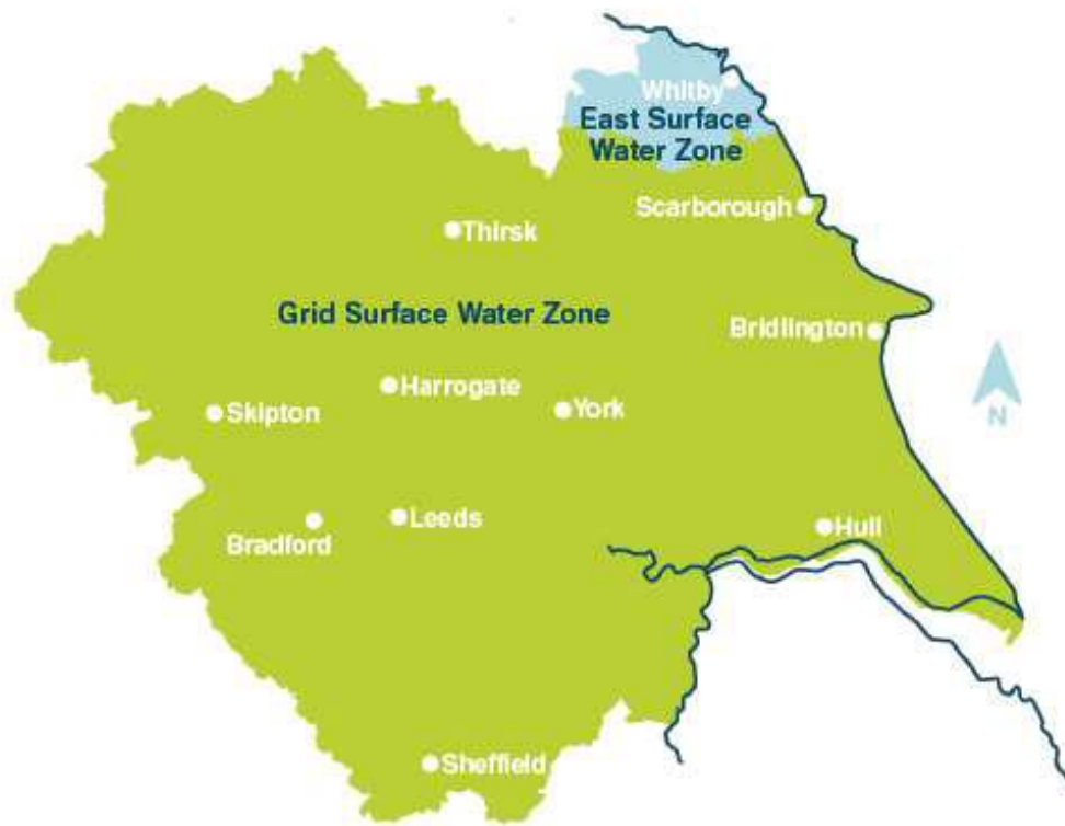
Figure 2. Yorkshire Water supply zones

Our WRMP is revised every five years, which ensures both risks and solutions are regularly reviewed, and our plans can be adapted if more appropriate solutions are identified. The next review of the WRMP is due to be published in 2023 and, as with previous plans, a consultation will be carried out on a draft version before it is finalised. Although our WRMP19 solution shows we will be in surplus once our current preferred solution is implemented, the risks to supply and demand will be reviewed in the next plan and we may require further investment. If, in future plans, updated information suggests there is a need to invest in additional interventions to maintain the supply-demand balance or improve resilience, we will carry out an options appraisal to select the best value solution. As part of this appraisal we are inviting third parties to submit bids for schemes that are not currently available to us in our WRMP, so that we can consider these in our next WRMP.