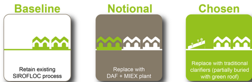
Figure 2: Summary of alternative solutions for the Rivelin site

AECOM assisted Yorkshire Water in testing the application of the Natural Capital Coalition's draft Natural Capital Protocol (the Protocol) to a trial site at Rivelin Water Treatment Works. This site is one of the primary water treatment plants supplying the City of Sheffield and is undergoing a £24m capital upgrade scheme to ensure the continued reliable supply of high quality water. A number of high level options were initially considered before two main solutions were assessed in more detail. This pilot retrospectively evaluated the natural capital impact of the two upgrade solutions (the 'notional' and the 'chosen' solution) compared to the existing baseline infrastructure (see Figure 2).