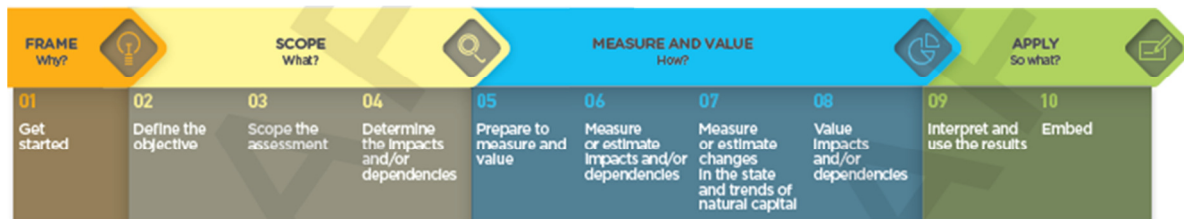
Figure 3: Natural Capital Protocol framework overview

The approach taken followed the framework set out in the Protocol. This follows four broad stages: to frame, scope, measure and value, and ultimately apply the Natural Capital Assessment (see Figure 3).