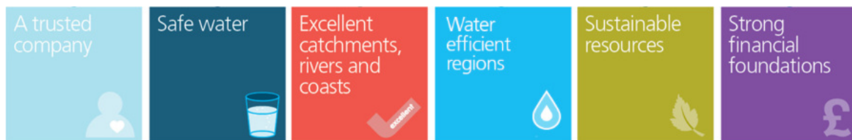
Figure 4: Yorkshire Water's six key strategic objectives

This supports Yorkshire Water's vision 'Taking responsibility for the water environment for good' and its six key strategic objectives: