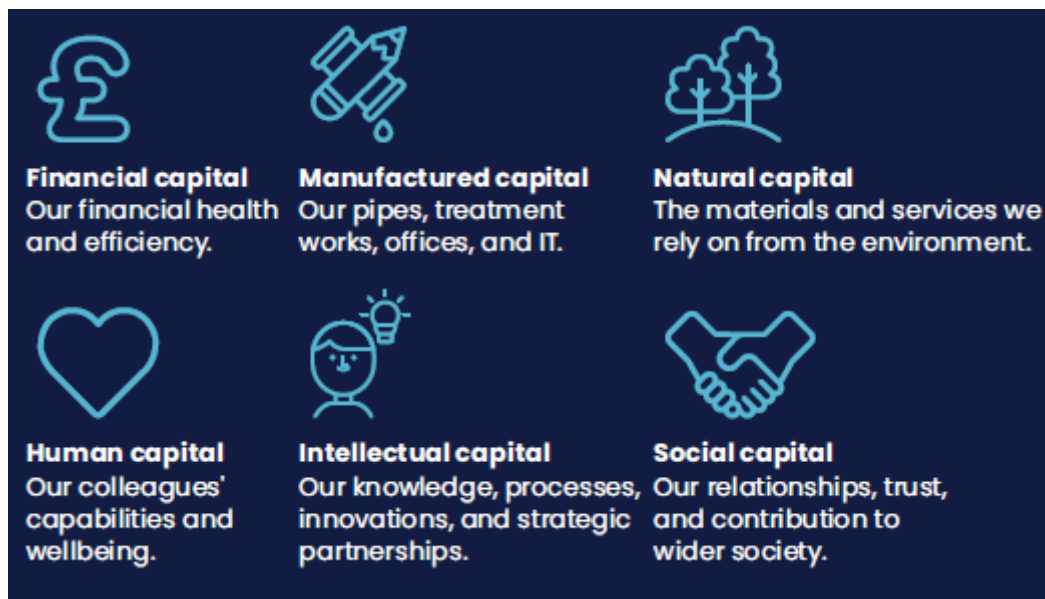
Figure 1: The Six Capitals – these are the resources we rely on and that we impact, both positively and negatively, through our business activities.

capitals approach can provide a much more detailed understanding of a company's performance than is captured in standard financial or operational performance reports.