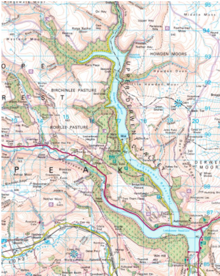
Figure 1.1: Source of Raw Water – Expansion of Derwent Valley Reservoir Group