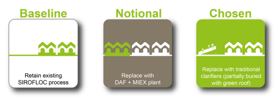
Figure 2: Summary of alternative solutions for the Rivelin site

AECOM assisted Yorkshire Water in testing the application of the Natural Capital Coalition's draft Natural Capital Protocol (the Protocol) to a trial site at Rivelin Water Treatment Works. This site is one of the primary water treatment plants supplying the City of Sheffield and is undergoing a £24m capital upgrade scheme to ensure the continued reliable supply of high quality water. A number of high level options were initially considered before two main solutions were assessed in more detail. This pilot retrospectively evaluated the natural capital impact of the two upgrade solutions (the 'notional' and the 'chosen' solution) compared to the existing baseline infrastructure (see Figure 2).