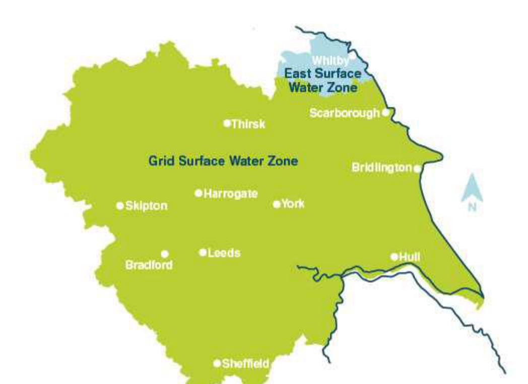
Figure 2. Yorkshire Water supply zones

To meet the Grid SWZ deficit and provide additional surplus in our region our WRMP19 presents a preferred solution that will reduce demand through additional leakage detection and repair activity. We plan to reduce our current leakage target by 40% by 2025, with further leakage reduction over the remaining 20 years of the planning period. We will also invest in two groundwater resources to improve resilience in our Grid SWZ.